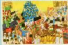
THE PURITY AND SILENCE-POWER OF BHARAT MOTHER SHAKTIS (PANDAVAS) WILL RE-ESTABLISH DEITY WORLD SOVEREIGNTY.