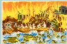
LOOK! THE SCIENCE-PROUD EUROPEAN YADAVS WILL DESTROY ONE ANOTHER IN THIS INTERNATIONAL ATOMIC WAR (MAHABHARAT) LIKE 5000 YEARS AGO.